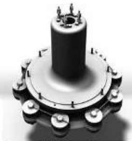
Internal 10-Point Suspension without Basket