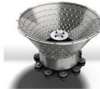
10-Point Suspension with Basket